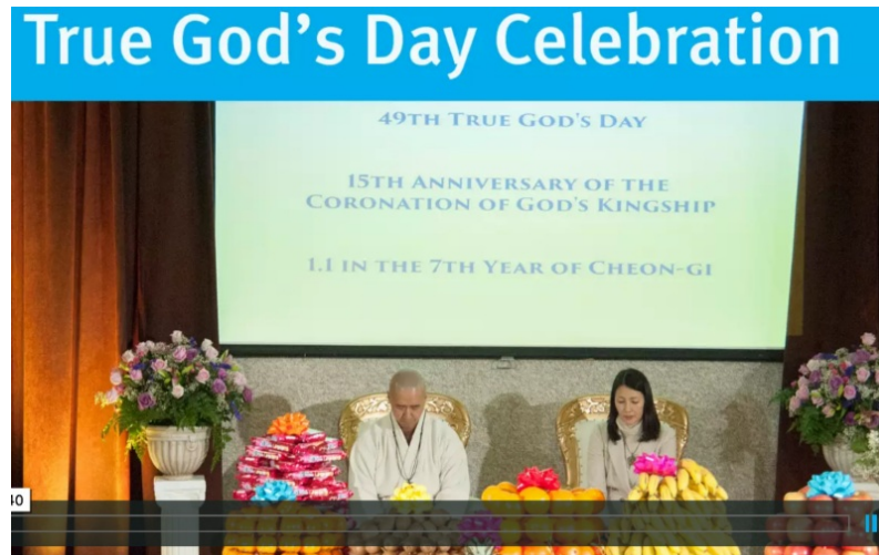
49th True God's Day Celebration